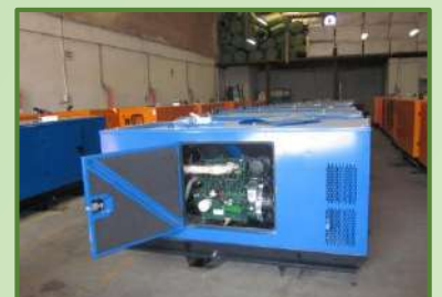
Acoustic Foam for Engine Generators