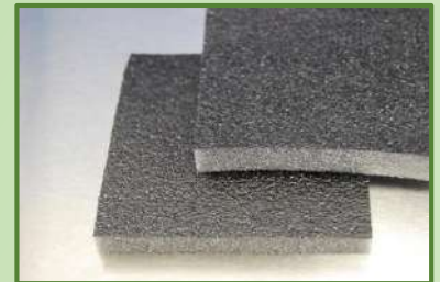
Acoustic Coated Foam Sheets

Absorption of sound energy therefore used in Sound Insulating Cabins, Vehicle Cabs, Mechanical Engineering, Partition Walls, Electrical Apparatus Construction, Enclosures etc.