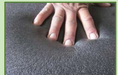
Quality TPU Coating